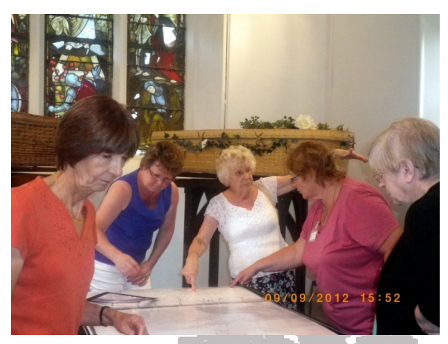
Visitors on the Discover Newbury Weekend viewing the cemetery maps looking for graves.

and has promised lots of new photographs, paintings and other memorabilia as well as a write up from the family perspective in the not too distant future. There are some exciting stories here.