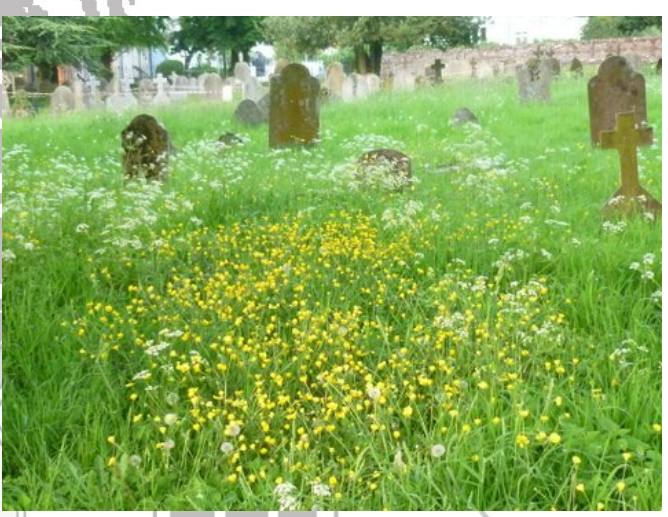
Summer flowers flourish in the uncut grass

Elsewhere in this Newsletter you will find details of our forthcoming A.G.M. - now don't duck for cover! I know how boring these can be and how one avoids them to ensure not being "lumbered"